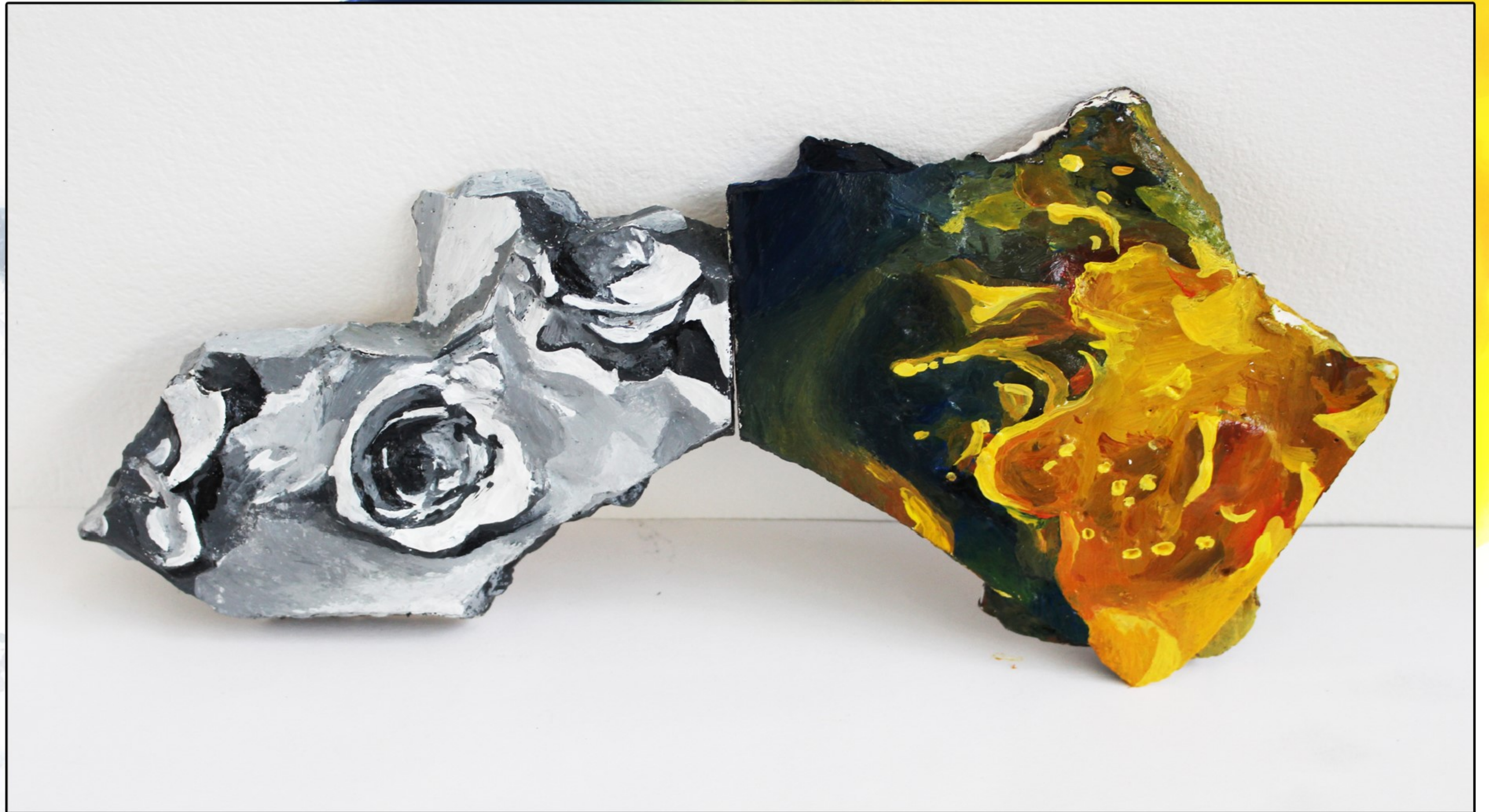
Medium: plaster, stone. Size: 18x10 cm Year: 2014

My favorite place is moon and Uranus. Looking at the earth and the universe from the moon, I think it's very beautiful. Especially I think the surface of Uranus is more beautiful because it's my favorite color. I choose to connect these two planets of reason is that I think is very convenient to travel the two planets.